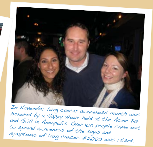
In November lung cancer awareness month was honored by a Happy Hour held at the Flame Bar and Grill in Annapolis. Over 100 people came out to spread awareness of the signs and symptoms of lung cancer. $2,000 was raised.