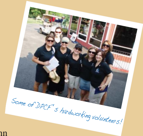
Some of DPCF's hardworking volunteers!

Thank you to all DPCF's friends, volunteers, sponsors, and especially our presenting sponsors: EnTrust Capital, Geaton and JoAnn DeCesaris Family Foundation, GenSpring, K. Hovnanian Companies, N.E.W. Charitable Foundation, and YPO: Geaton's Forum.