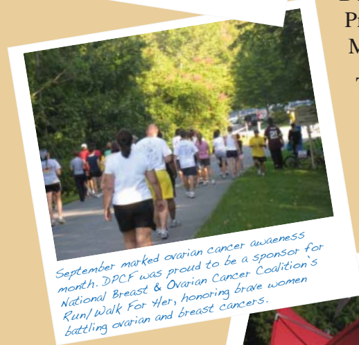
September marked ovarian cancer awareness month. DPCF was proud to be a sponsor for month. DPCF was proud to be a sponsor for National Breast & Ovarian Cancer Coalition's Run/Walk For Her, honoring brave women battling ovarian and breast cancers.