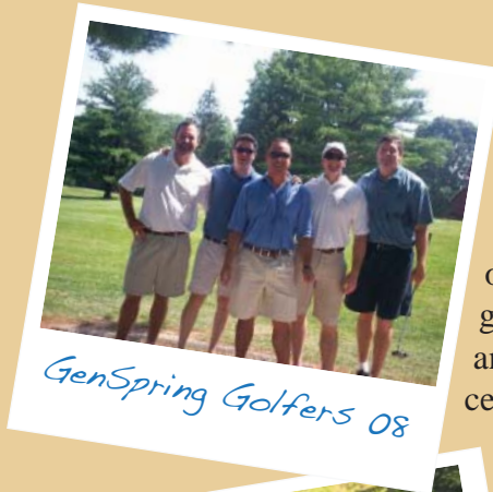
GenSpring Golfers 08

DeCesaris/Prout Cancer Foundation is on Facebook!